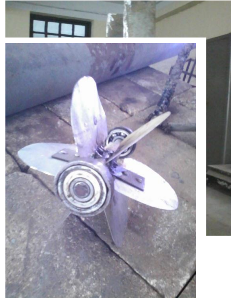
Fig 2: Water turbie

The construction of a conveyance water system from the upstream side of waterfall to the pump and power systems at downstream side of waterfall using PE-pipe type was installed with the inner diameter of 100mm. The electrical controller system to be adapted at normally voltage of 220V was installed by using the parallel